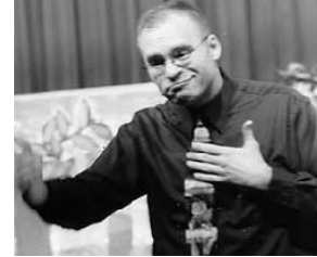
(Photograph taken at MSD)

I attended Bowie High School in Bowie, MD,