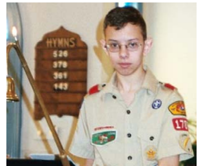
A Boy Scout participating in the worship service

Every second Sunday of February, the United Methodist Church observes the importance of Scouting (Boy Scouts and Girl Scouts) and its effectiveness in its community, nation and the world.