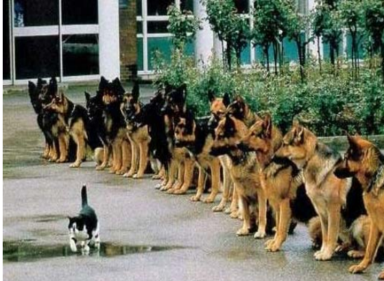
"Yea, though I walk through the valley of the shadow of death, I will fear no evil" Psalm 23