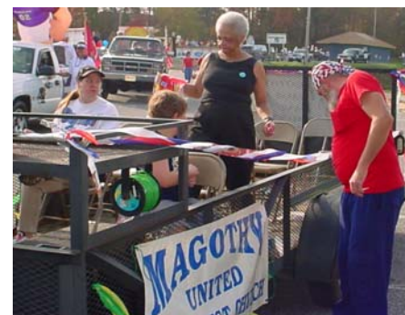
Our preparation for the parade.

On Sunday, November 2 nd members of Magothy Deaf church and Magothy hearing church participated in the Harvest Day Parade in Pasadena. Food was generously donated and collected for those in need for the Thanksgiving holiday. We filled up our entire float with food to add to our Door Step Mission project. Everyone had a great time.