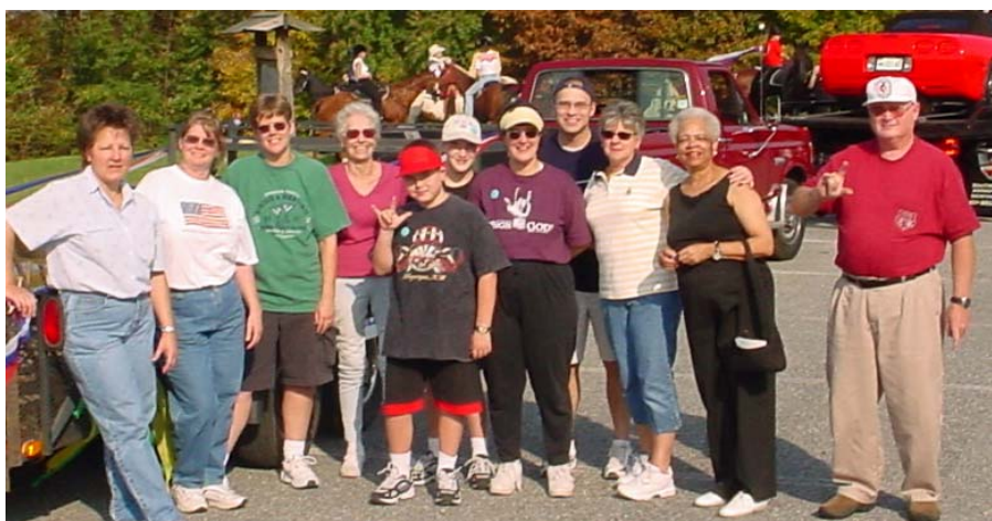
This is a group picture of those participating in the Harvest Day Parade on November 2 nd . Many thanks to the volunteers.

Many churches hold a service of preparation for Christ's coming, which includes hanging greenery traditionally associated with everlasting life. Greens such as cedar for royalty, fir and pine boughs for everlasting life, holly symbolizing Jesus' death and ivy representing the resurrection are used.