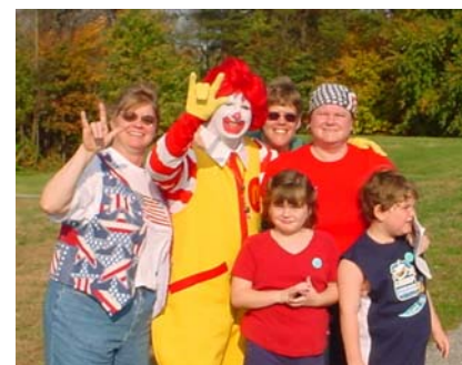
We were greeted by Ronald McDonald during the parade.