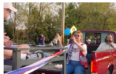
During the parade we sang and signed hymns for the public.