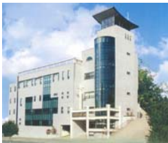
The new church building

Church of the Deaf is considered to be the world's largest deaf church with about 550 deaf members. They sent and have supported a deaf missionary to Bangladesh and were instrumental in establishing