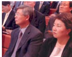
At the dedication ceremony

Church of the Deaf is considered to be the world's largest deaf church with about 550 deaf members. They sent and have supported a deaf missionary to Bangladesh and were instrumental in establishing