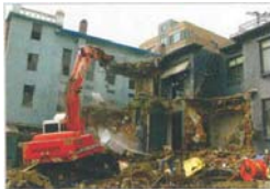
Demolition of the old building

off the debt, they held the dedication ceremony of the new church building on October 15, 2006. At the same time, they celebrated the 60 th anniversary of the deaf church. I was invited to join at the joyous event as their former senior pastor. The Youngnak Presbyterian