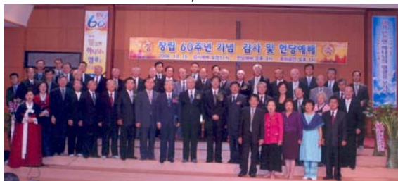
Pastors and elders present at dedication

more than 15 deaf churches in Korea. More than 30 deaf pastors had been raised up at that church when they were young. Two presidents of the Korean Association of the Deaf are members of the church as well. Youngnak Presbyterian Church of the Deaf was, is, and will continue to be a huge influence on the deaf community in Korea.