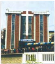
The old church building

When I was senior pastor of the Youngnak Presbyterian Church of the Deaf in Seoul, Korea, we gathered in a 30-year-old building. As the church grew and flourished, there was an influx of more members. As a result, the sanctuary was virtually filled up with congregants. So, the members agreed to construct a new church building to accommodate more congregants. They pulled the old building down and built a new one. The building was finally completed in December of 2003. After paying